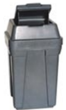
Nappy disposal service 65 litre capacity unit