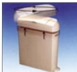
Reversible cover eases location in cubicle