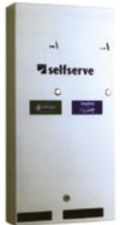
System 500 Dual Dimensions: H 700mm W 350mm D 100mm